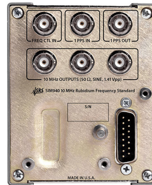
SIM940 rear panel